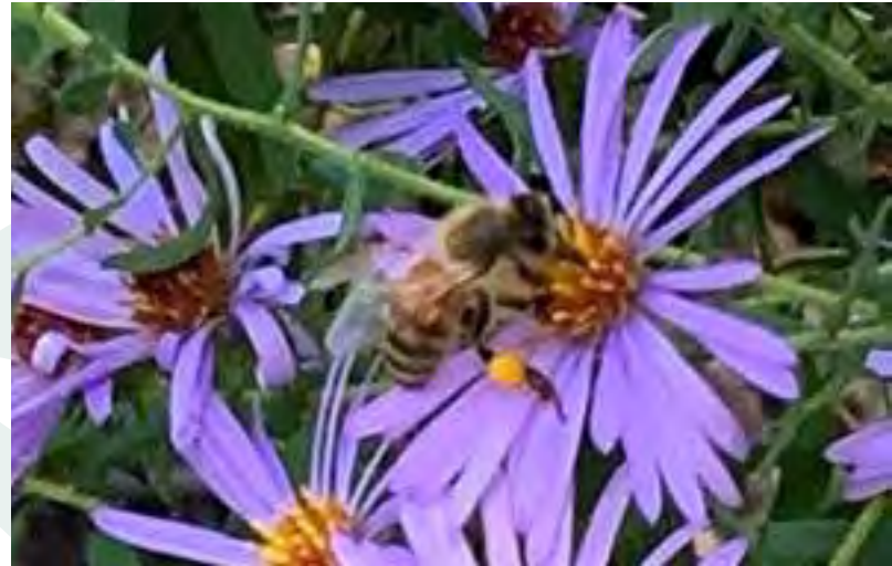
A honeybee packing pollen visits a New England Aster in my Rolla, Mo., garden.